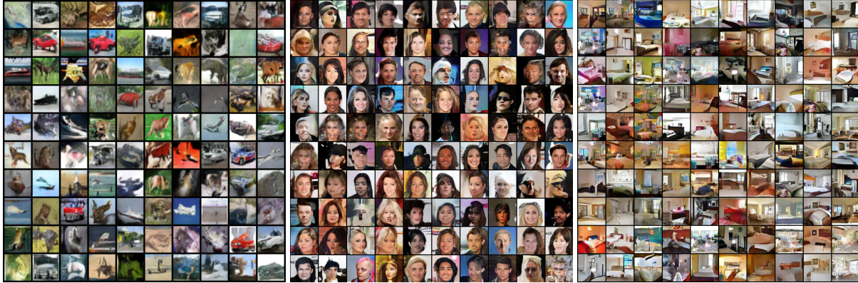
Figure 1: Generated samples. Left: CIFAR-10 generation. Middle: CelebA generation. Right: LSUN bedroom generation.