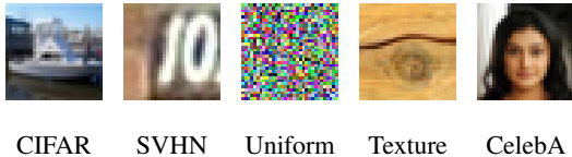
Figure 4: Illustration of images from CIFAR-10 test, SVHN, Uniform Random, Texture and CelebA. The last four are considered to be OOD distributions.