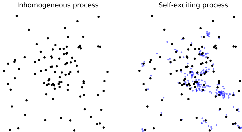
FIG 2. At left, a realization of an inhomogeneous Poisson process, in which the intensity is higher inside a central square and lower outside. At right, a self-exciting process with average total cluster size of 4, using the inhomogeneous Poisson process as the background process. Excited events are shown in blue. The cluster structure of the process is clearly visible, with clumps emerging from the self-excitation.

Marks can have several useful properties. A process has independent marks if, given the locations and times \{(s_i, t_i)\} of events, the marks are mutually independent of each other, and the distribution of \kappa_i depends only on (s_i, t_i) . Separately, a process has unpredictable marks if \kappa_i is independent of all locations and marks \{(s_j, t_j, \kappa_j)\} of previous events ( t_j < t_i ).